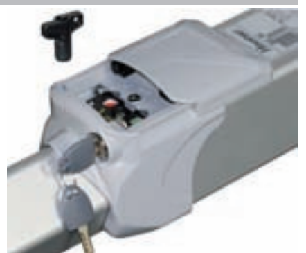
Valve casing with sliding lid: manual release and pressure adjustment valves