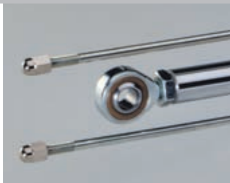
Detail of adjustable spherical head