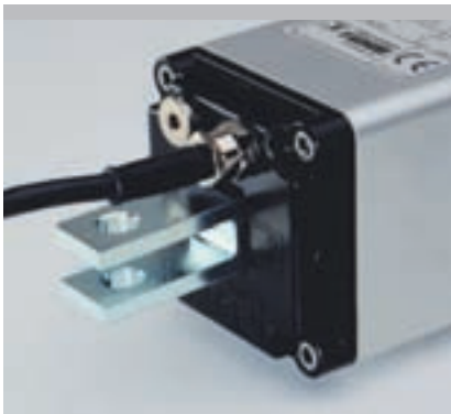
Back plate with swivel fork