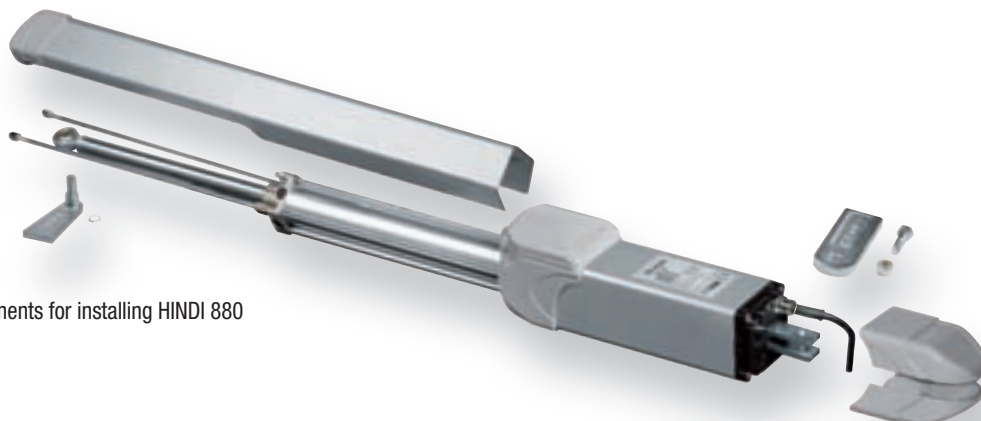
Components for installing HINDI 880