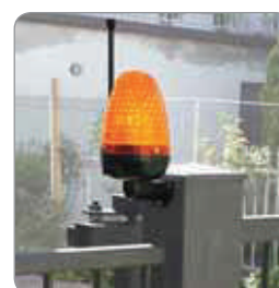
Gate post mount