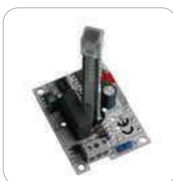
Card with LEDs

It can be mounted on to a wall or pillar (fittings inside the package). Designed to take the BIRIO A8 aerial where required.