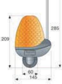
gate post mount