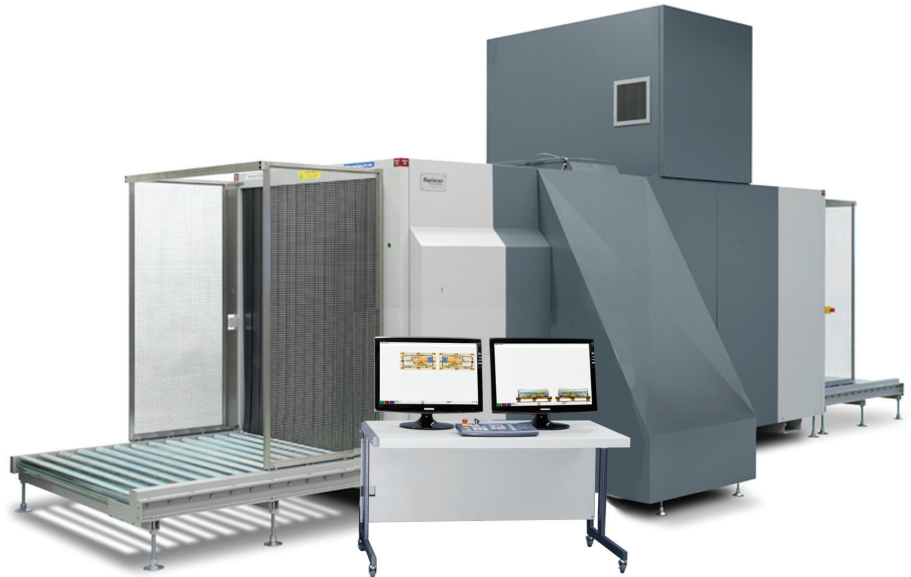
Tunnel Opening (width x height): 1,537 x 1,650 mm (60.5 x 65.0 in)

sales@rapiscansystems.com www.rapiscansystems.com